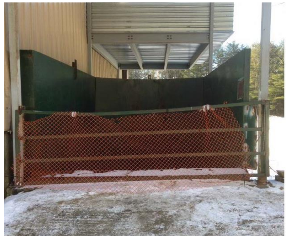
As of January 20, 2016

As shown in Table 5, of our 100 test cases, 15 (1) there was independent evidence 16 in DEC's files that 66 had completed required actions or had otherwise come into compliance, and (2) in 10 cases, the required action by the violator was pending. 17 However, DEC's files did not include evidence that violations had been addressed in 18 of the 100 test cases. In nine of these cases, DEC's files did not include evidence that the program had followed up on the violation or the required corrective action. In the other nine cases, the DEC files included assertions by the violator that the program's compliance directive had been addressed, but there was no independent evidence that an action had been taken, such as on-site visits by DEC personnel, pictures, or receipts. Without such information, DEC cannot be certain whether environmental violations remain on-going or have been addressed.