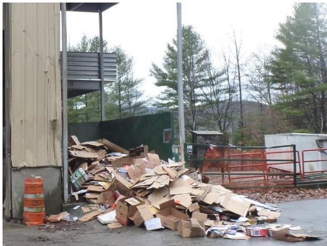
As of December 3, 2015