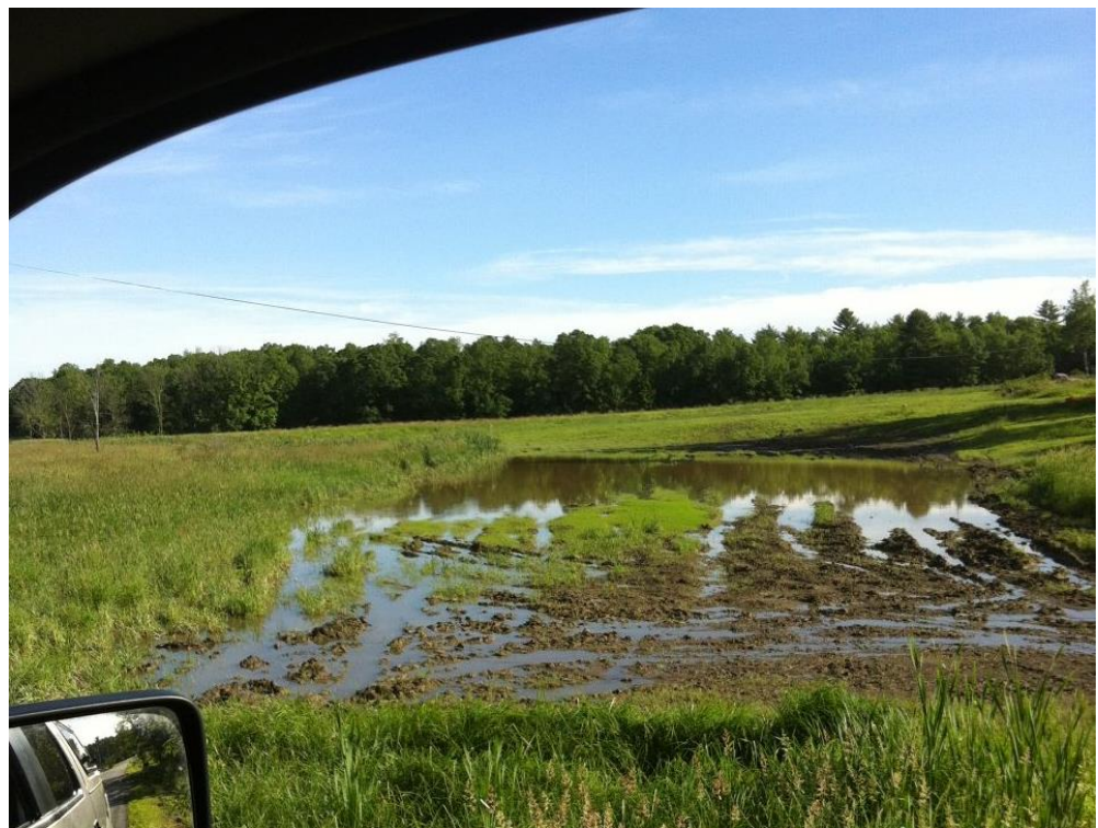
Figure 3: Picture of Wetlands Violation Taken on May 25, 2016 and Not Addressed as of July 10, 2017

We attribute the lack of follow-up in the wetlands program to the ineffective use of its tracking system, which was only recently implemented. 19 DEC requires every division to have a system in place that documents the ultimate resolution of any significant violation that comes to the attention of the division. However, when we requested a list of wetland cases that had been investigated between October 1, 2015 and September 30, 2016, the wetlands program manager manually developed the list by obtaining input from her staff because she could not rely on the information in the program's database. In addition, we found the wetlands program's tracking system was (1) missing investigations, (2) did not always include the most recent results of cases that had been previously investigated, and (3) did not always include data in the screen that recorded whether follow-up was needed. The wetland's program director attributed the problems we found to two causes: (1) the wetlands program does not have a protocol that directs staff on use of the system, and (2) the follow-up screen is a new feature in the system and staff were not asked to record this information for cases that had been closed. By not recording the information related to cases in a timely manner,