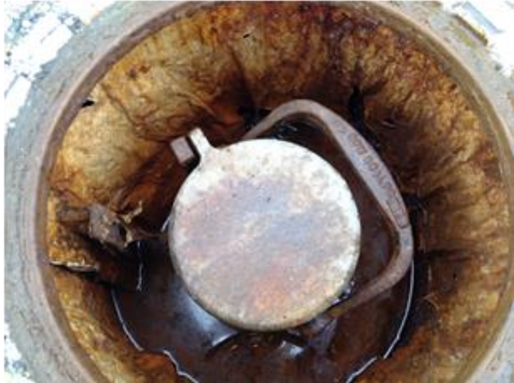
Figure 4: Picture of a Corroded Spill Bucket UST Found in April 2016 For Which Follow-Up to Determine if the Violation was Corrected Was Not Performed